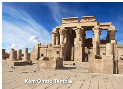
Kom Ombo Temple