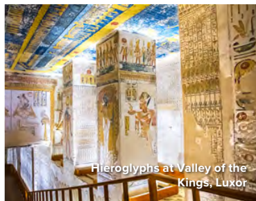
Hieroglyphs at Valley of the Kings, Luxor