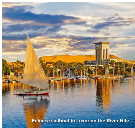
Felucca sailboat in Luxor on the River Nile