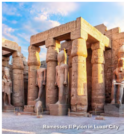
Ramesses II Pylon in Luxor City