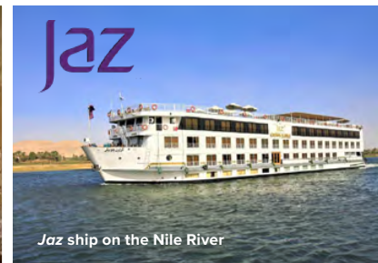
Jaz ship on the Nile River

The nearby terraced Temple of Hatshepsut is carved into the limestone cliffs of the Deir el-Bahari. This lavish shrine to Queen Hatshepsut, one of the few women to ever be crowned as pharaoh, represents a highpoint in Egyptian art and architecture. (B, L, D)