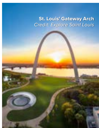
St. Louis' Gateway Arch