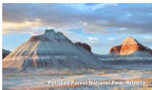
Petrified Forest National Park, Arizona

— Land Route ● Overnight Stay ● Day Stop